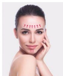
Forehead and Jaw